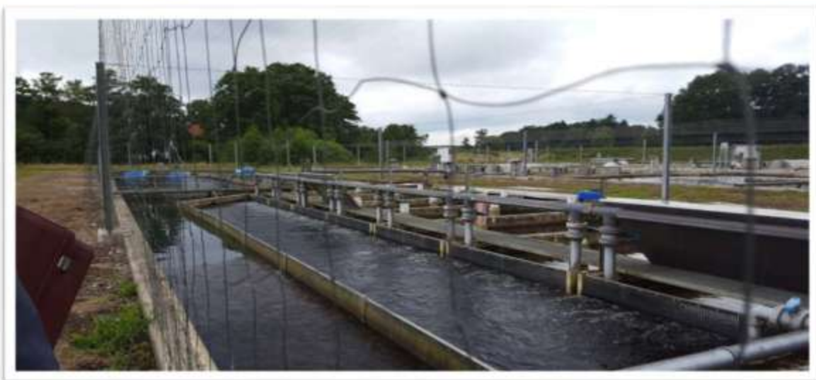
Visiting Aquaculture Fischtechnik trout farms and RAS systems, Hannover- Germany