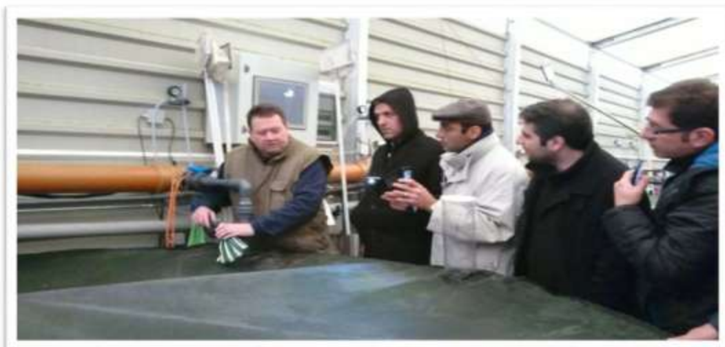
Giving presentation about advanced equipment of Aquafuture C. Hogene, Germany