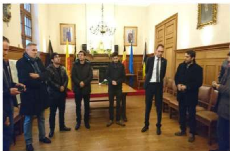
Giving primary presentation before entering Mathonet-Gabriel fish farms, Malmedy-Belgium