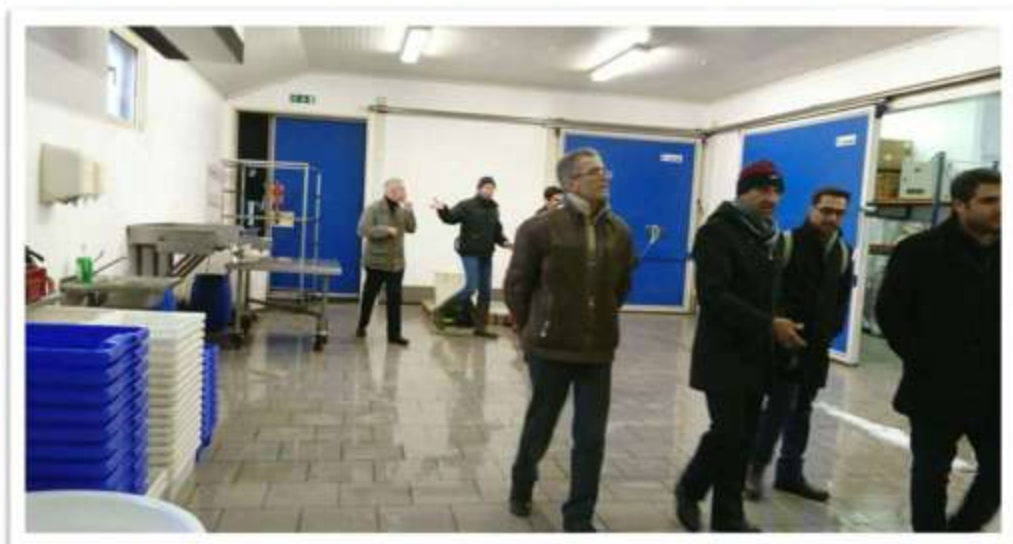
Visiting Mathonet-Gabriel trout farms and packaging process, Malmedy-Belgium