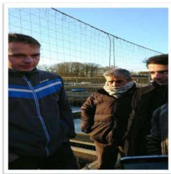
Holding question and answer session in Fischtechnik trout farms, Hannover- Germany