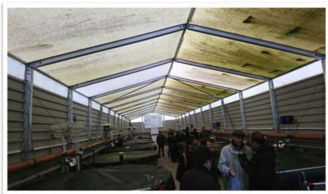
Holding question and answer session in fish farms of Aquafuture C. Hogene, Germany